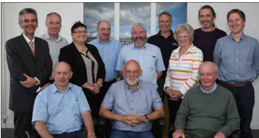
LELP Working Group welcoming Lough Erne Heritage

LELP are delighted to announce that Lough Erne Heritage are now formal partners of the Lough Erne Landscape Partnership. The Lough Erne Heritage group brings enthusiasm of the heritage of the Lough Erne region and a specialist knowledge of maritime heritage on the Lough throughout the years.