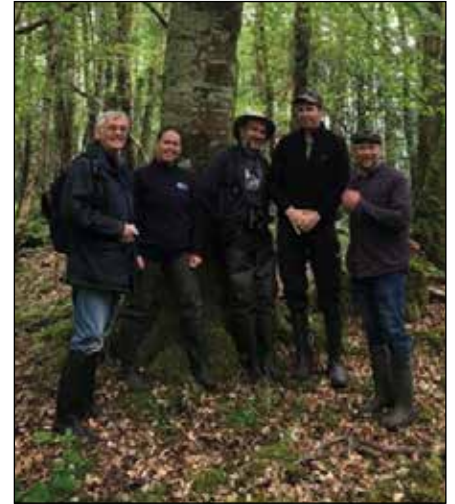
RSPB and FBKA installing a wild bee box on one of the island reserves

Throughout spring and summer LELP working in collaboration with Butterfly Conservation and Fermanagh Beekeepers, delivered a series of workshops to teach people about pollinators and their habitats.