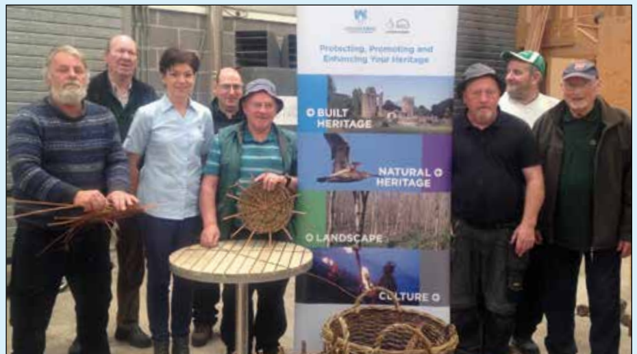
Lisnaskea Men's Shed

Twenty-four people participated in the programme to learn about willow weaving as a heritage craft and to create wonderful baskets in a fun and engaging environment.