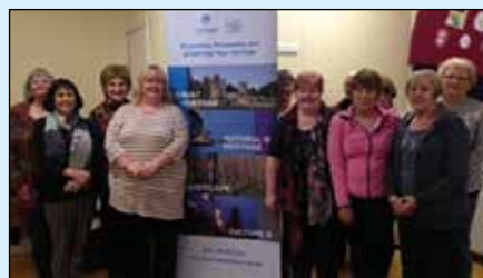
Belleek Women's Shed

A heritage skills celebration event is planned for November to provide an opportunity for all participants to showcase their willow craft items and learn more about other heritage skills & crafts including lacemaking, beekeeping and traditional farming skills.