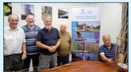
Enniskillen Men's Shed