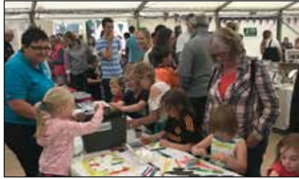
Children taking part in crafts at Festival Lough Erne.

Throughout the summer months LELP attended several Community events across the county, this included the Belleek Regatta, Fermanagh County Show and Festival Lough Erne. The events were all well attended and enabled the team to share the work of the partnership and project partners with a wide audience. At several of the events the team worked with young people to provide an understanding of natural heritage through craft work. Everyone seemed to have a fantastic time creating butterflies and bumble bees or planting spring bulbs. If you see the team at any events, please do pop over and say hello and learn more about the projects that the Partnership is carrying out.