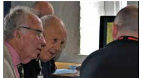
Museum volunteers learning how to digitise fragile archives.