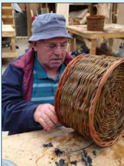
Concentration! Lisnaskea Men's Shed